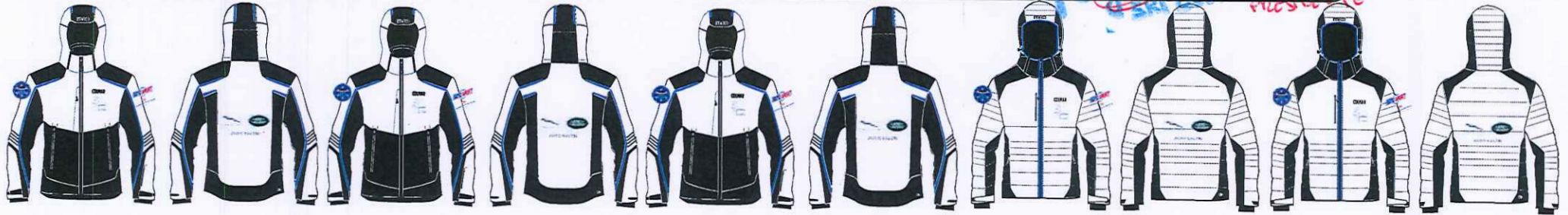
B4512_5NX_01G white&black&danube blue